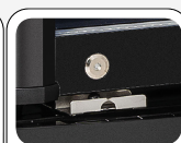
Lock fitted as standard