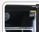
Inner assistance fan/Inner vertical LED light